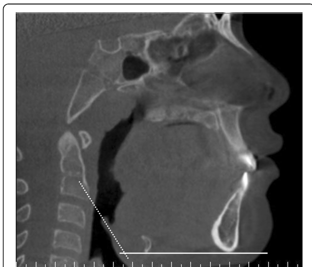
Fig. 2 Sagittal CBCT image showing the inclination of epiglottis; the angle formed by the long axis of epiglottis (dotted line) relative to the horizontal plane (solid line)

Prior to any measurement, the CBCT volume was adjusted such that the Frankfort plane (eye-ear plane) and interorbital line were parallel to the horizontal plane, and any right-left rotations were corrected. The gonial angle, as conventionally described, was that between the intersection of the ramus and the mandibular lines (Fig. 1) [21]. The inclination of the epiglottis was measured as the angle at the intersection between the horizontal plane and a line drawn through long axis of the epiglottis (Fig. 2). The latter was chosen based on an observation by the multidisciplinary group of a possible association between large gonial angle and posterior tilt of the epiglottis, which may affect airflow into the laryngeal inlet.