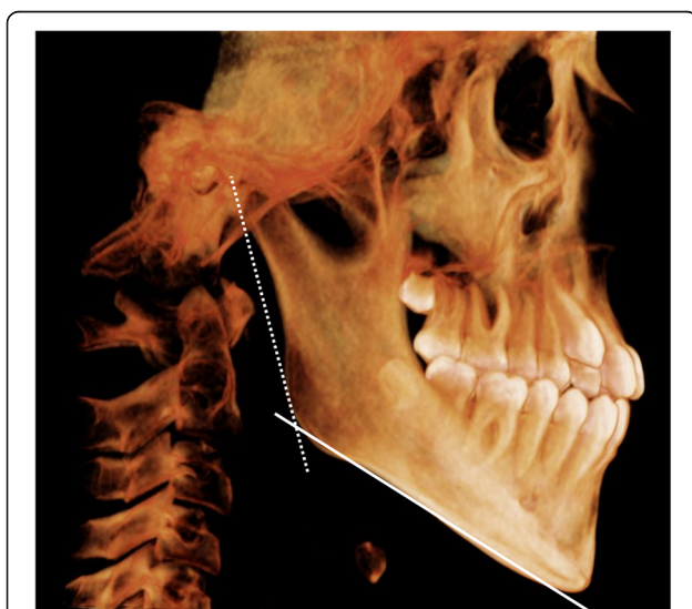
Fig. 1 Lateral 3D image reconstructed from CBCT showing the gonial angle; formed by the mandibular plane (solid line) and ramus plane (dotted line)

DISE was conducted using a uniform technique and reported in a structured format that was previously