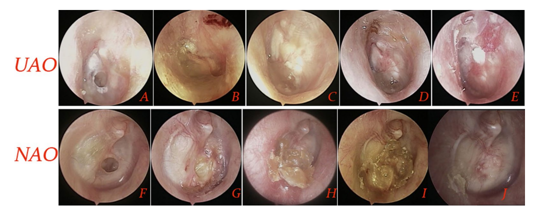
Fig. 2 Followup procedure of two techniques. UAO technique. A: Preoperative perforations; B: one week after surgery; C: 4 weeks; D: 2 months; E:4 months. NAO technique. F: Preoperative perforations; G: 2 weeks after surgery; H: 4 weeks; I: 2 months and J: 3 months