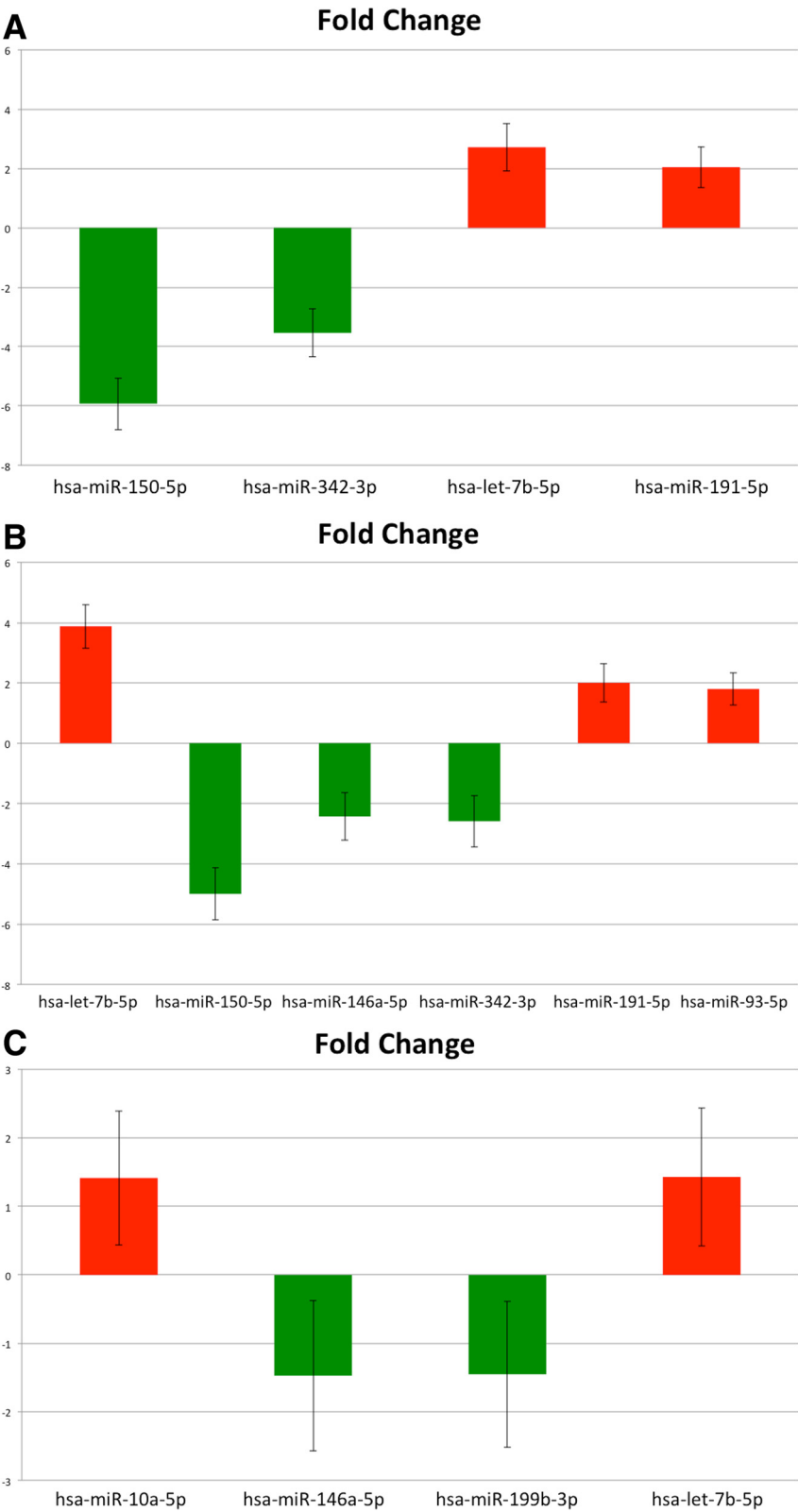
Fig. 1 (See legend on next page.)