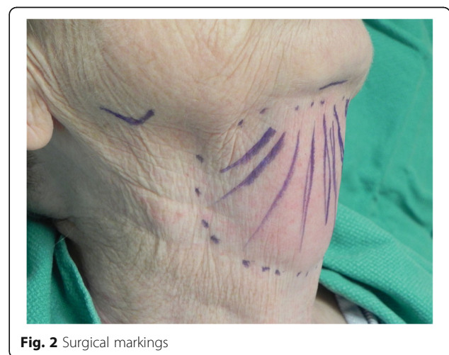
Fig. 2 Surgical markings